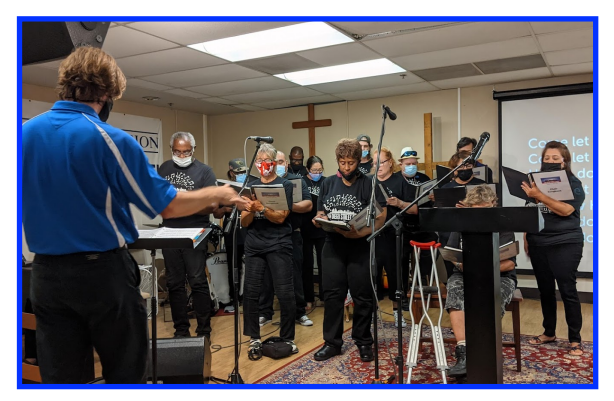
Chapel Service at San Diego Rescue Mission