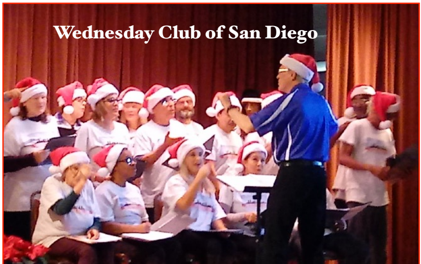
Wednesday Club of San Diego