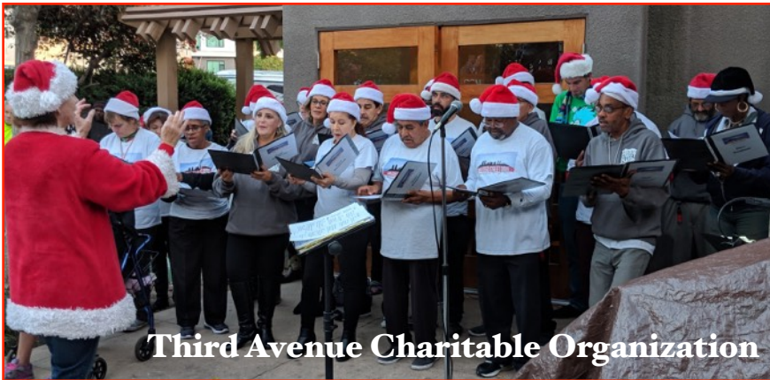
Third Avenue Charitable Organization