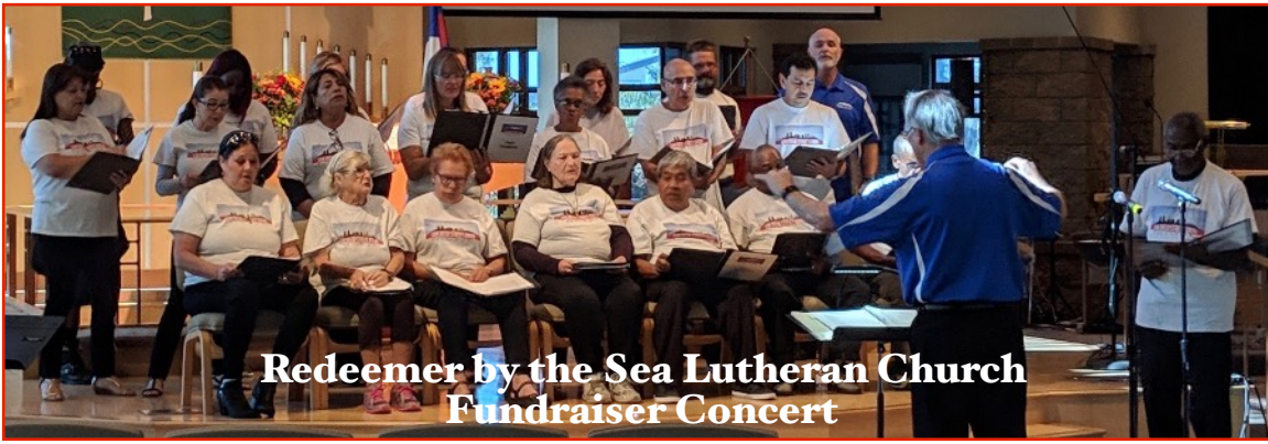
Redeemer by the Sea Lutheran Church Fundraiser Concert