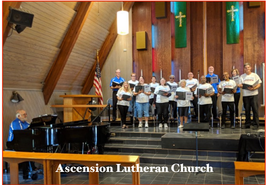
Ascension Lutheran Church