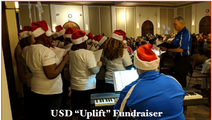
USD "Uplift" Fundraiser