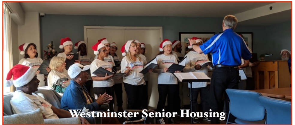
Westminster Senior Housing