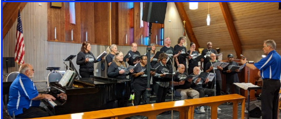
"The Welcome" Community Event Ascension Lutheran Church