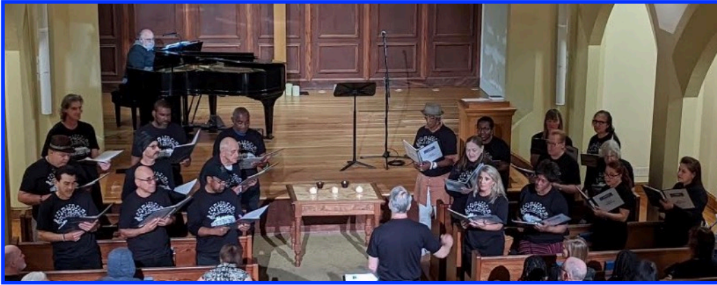
Ash Wednesday Service First Pres. San Diego