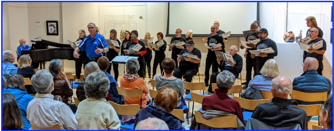
Point Loma Library Concert Series