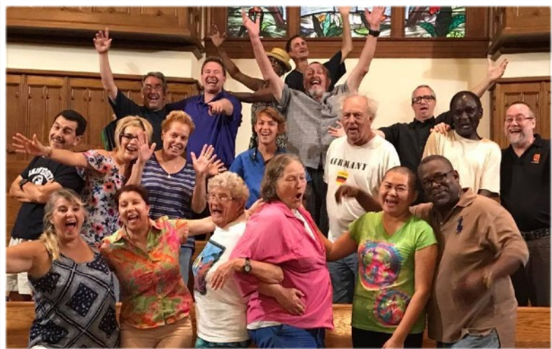
SDSC is more than singing. It's FUN, FAMILY, and FELLOWSHIP