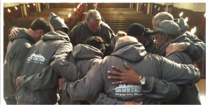
A God-Inspired Ministry