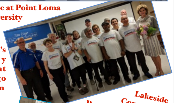
Lakeside Community Presbyterian Church