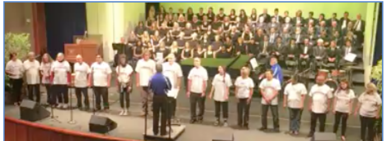
In performance at Point Loma Nazarene University

I was able to see the bigger picture. Even when I was experiencing painful side effects, I could see these were just learning moments in my life. I knew the pain would pass. Undergoing chemotherapy helped me get my priorities straight. I realized the importance of the relationships I have in my life. I began telling the people I care about, how I feel about them. I told them how thankful I am that they are in my life. It also gave me the knowledge and compassion to reach out and help others having difficulties coping with their own personal cancer battle.